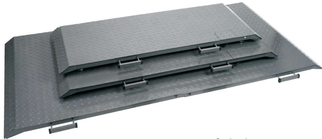
Option 1: Non-approved Version (EHI-CW)