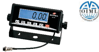
Option 2: OIML Approved Version (EHI-E1)