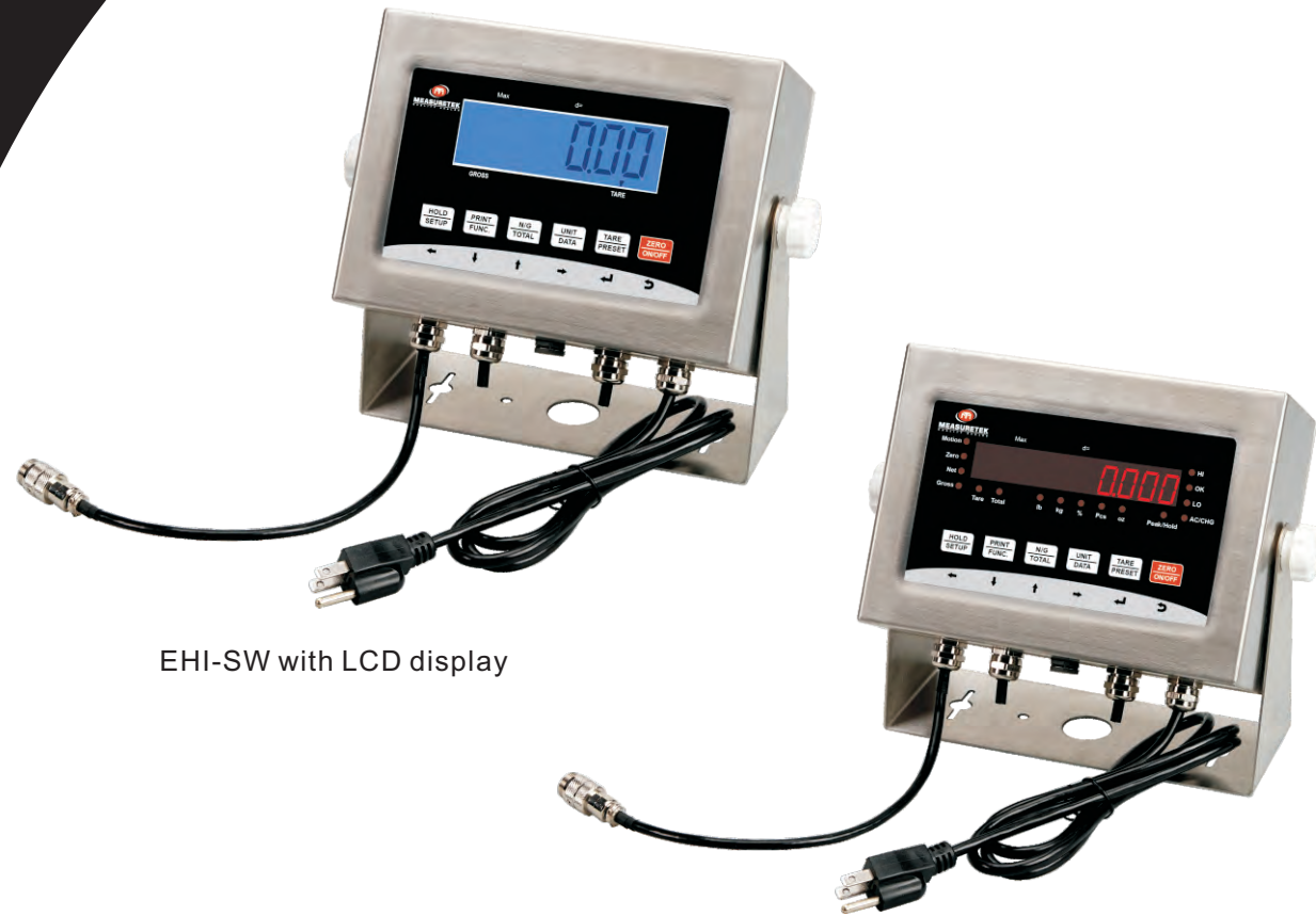
EHI-SW with LCD display