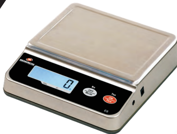
ES with square pan