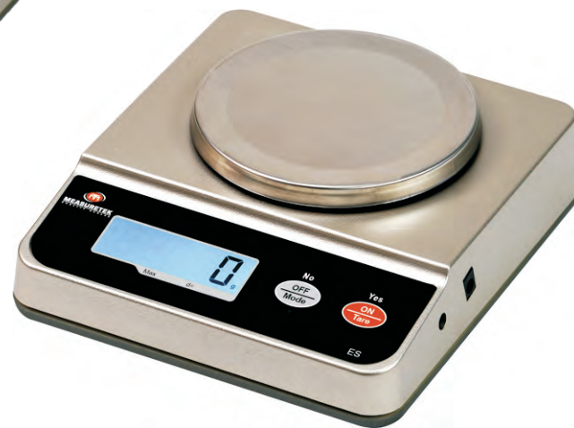
ES with round pan